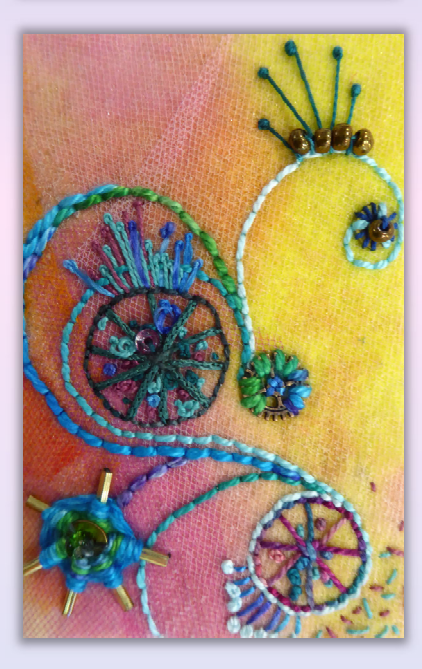
Students in this course will receive a complimentary copy of Designing with Circles 1 , our Self-paced downloadable sketchbook course, to further their explorations after the course.