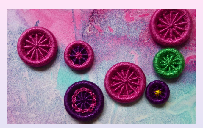
This class is open to beginners and all levels of experience