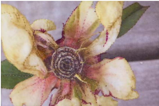
© Digital Tex. le Art - Susan Copeland

Work from your own photographs or original artwork. There will be opportunities to see and try various methods of creating printed fabrics for enrichment. Layers of sheer fabrics will be used to increase and enhance tonality of your print. Stitching by hand and/or machine will be one of our starting points. Students will have options to express individuality in their artistic approach and will be coached on the methods that they would like to pursue for their printed artwork.