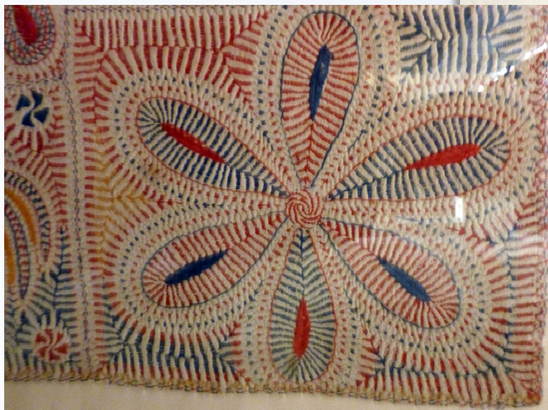
Kantha Embroidery from Bengal, photographed at Victoria and Albert Museum, London, U.K.