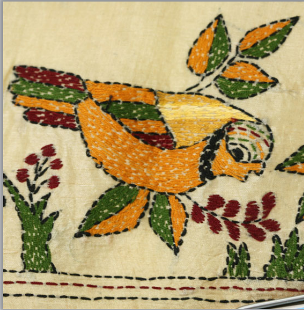
From Penny Peter's collection

Penny and I will have our collection of traditional Kantha Embroidery at the studio. Students will be able to photograph and sketch them as well.