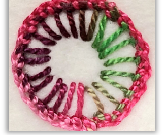
Students will paint their own felt fabrics before stitching on the pages