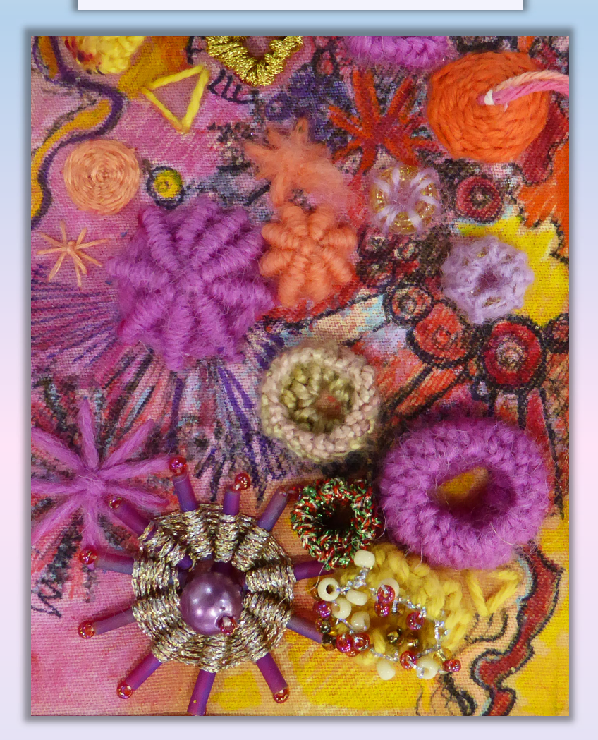
Here are some of the stitches we will be working on