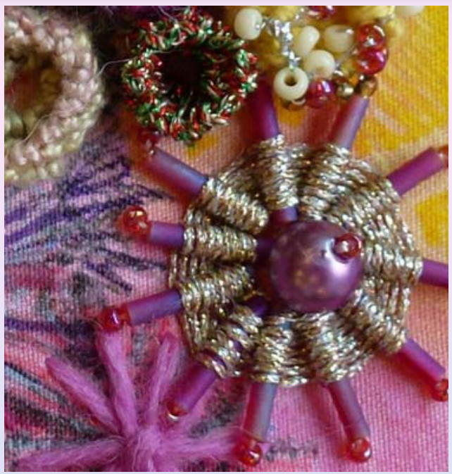
This class is open to beginners and all levels of experience

This class will be devoted to the creation of beautiful hand stitches in a small handmade book using both surface and raised embroidery methods. A variety of 20+ unique stitches and techniques will be used. There will be videos to show the stitches and sent to students after the class. Even if you have little or no previous experience, you will easily be able to access this hands-on experience along with other like minded people in our virtual classroom!