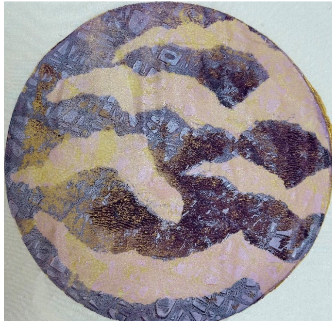
Multi-layered Gel print on Silk Habotai ©Christina Fairley Erickson

This festive workshop will allow you to learn many techniques using a Gel or Gelli print plate. You will be able to bring home wonderfully patterned one-of-a-kind fabrics and papers to include in your own artwork, quilts, wearable art, collages, handmade books, quilts, or other fiber/art projects. You'll also be able to create a reference library of small samples to document your techniques.