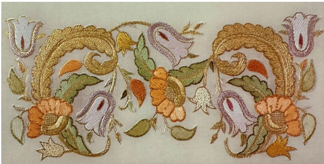
Contemporary Turkish Embroidery Design