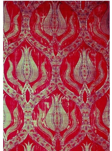
16th C Ottoman Tulip Textile

While Day 2 will include Machine stitch, you can also choose to work both days in hand stitch.