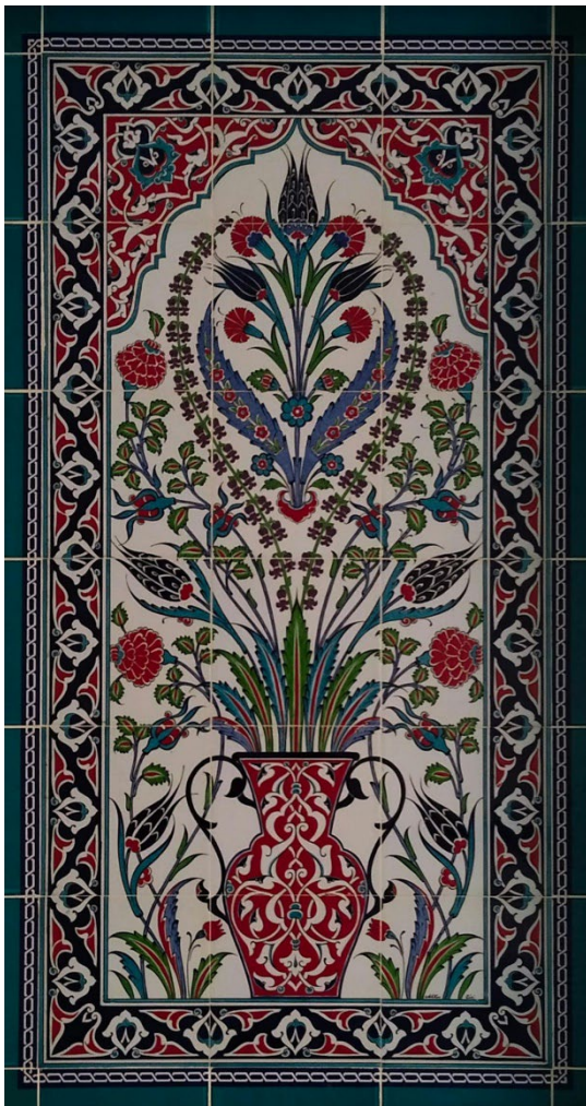
Tulips in Iznik Tiles, Türkiye - Photo by Filiz saglam on Pexels.com